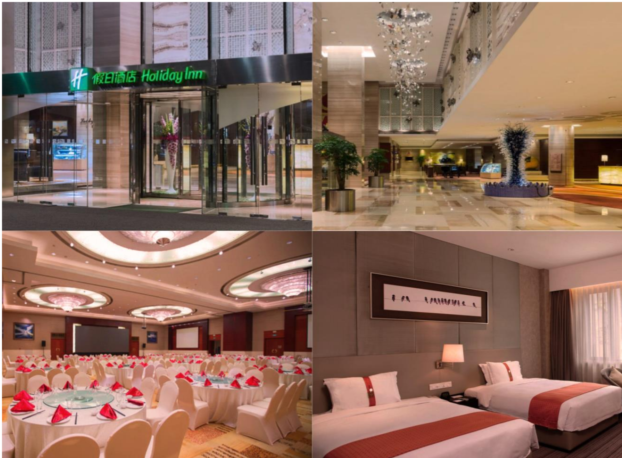
Holiday Inn Aqua City Nanjing

Holiday Inn Aqua City Nanjing is located next to Xinjiekou CBD and Confucius Temple district, with walking distance to metro line 1 Sanshanjie Station and line 3 Fuzimiao Station. About 15 mins by metro to Nanjing South Station or Nanjing Station. With 45km in 40mins distance to Nanjing Lukou International Airport. The hotel is connected to Aqua City shopping mall. Shopping Fun and Maoye Plaza are also nearby. From the hotel you can walk to the Nanjing historical Qinhuai River. There are also the East Zhonghua Gate Historical Culture Block, Zhanyuan Garden, Former Residence of Ganxi, Zhonghua Gate and Porcelain Tower of Nanjing around the hotel. The hotel has five multi-function meeting rooms, ranging from 60-120 square meters provide diversified services, a full range of facilities and equipment. The hotel is able to fully meet the needs of events in any size and is a great choice for conferences and banquets. The environment of the lobby bar is easy and pleasant. It is a place for business meetings and conversations with friends, 5F a tastefully modern all-day dining restaurant can provide fresh and delicious food. 6F the gym and swimming pool are available for guests. As well as the business centre and executive club lounge. Check into the Holiday Inn Aqua City Nanjing, you will have a relaxed and comfortable business or vacation trip.