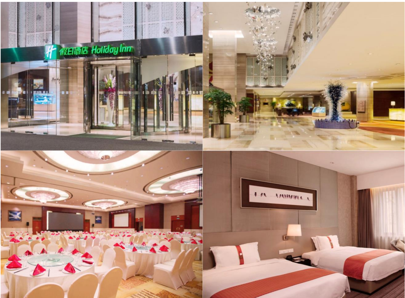
Holiday Inn Aqua City Nanjing

Holiday Inn Aqua City Nanjing is located next to Xinjiekou CBD and Confucius Temple district, with walking distance to metro line 1 Sanshanjie Station and line 3 Fuzimiao Station. About 15 mins by metro to Nanjing South Station or Nanjing Station. With 45km in 40mins distance to Nanjing Lukou International Airport. The hotel is connected to Aqua City shopping mall. Shopping Fun and Maoye Plaza are also nearby. From the hotel you can walk to the Nanjing historical Qinhuai River. There are also the East Zhonghua Gate Historical Culture Block, Zhanyuan Garden, Former Residence of Ganxi, Zhonghua Gate and Porcelain Tower of Nanjing around the hotel. The hotel has five multi-function meeting rooms, ranging from 60-120 square meters provide diversified services, a full range of facilities and equipment. The hotel is able to fully meet the needs of events in any size and is a great choice for conferences and banquets. The environment of the lobby bar is easy and pleasant. It is a place for business meetings and conversations with friends, 5F a tastefully modern all-day dining restaurant can provide fresh and delicious food. 6F the gym and swimming pool are available for guests. As well as the business centre and executive club lounge. Check into the Holiday Inn Aqua City Nanjing, you will have a relaxed and comfortable business or vacation trip.